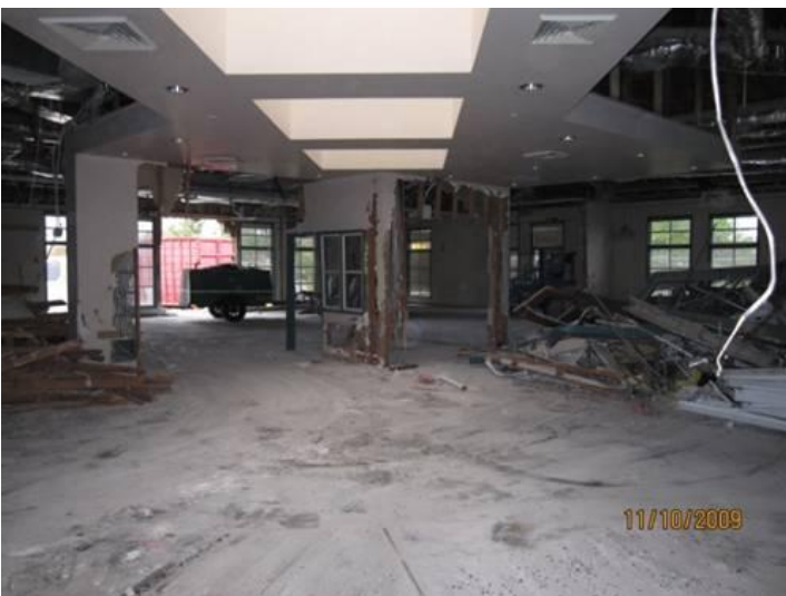
J-35 - Building 700 Renovation Project