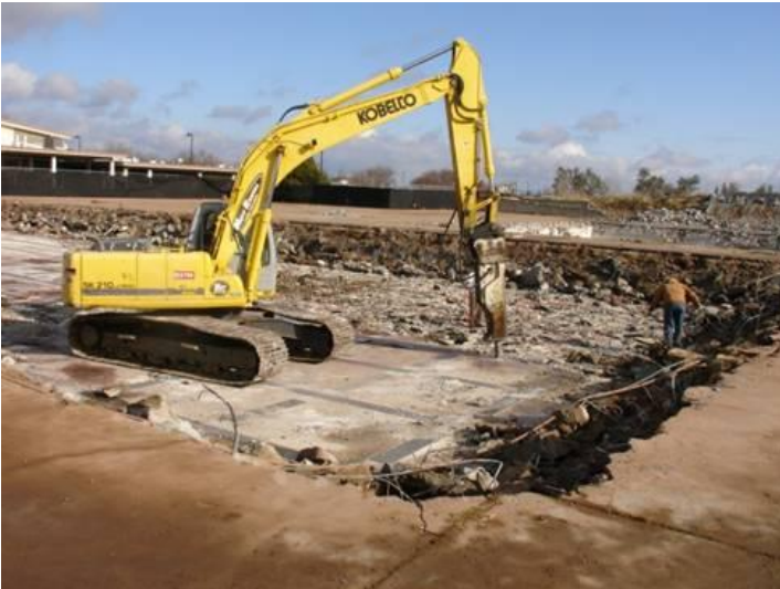
J-14 - Pool Demolition