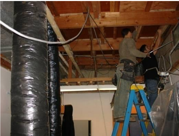
J-30 - IT Server Room HVAC Upgrades