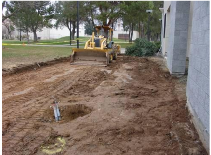
J-21 - Building 1800 ADA Renovations