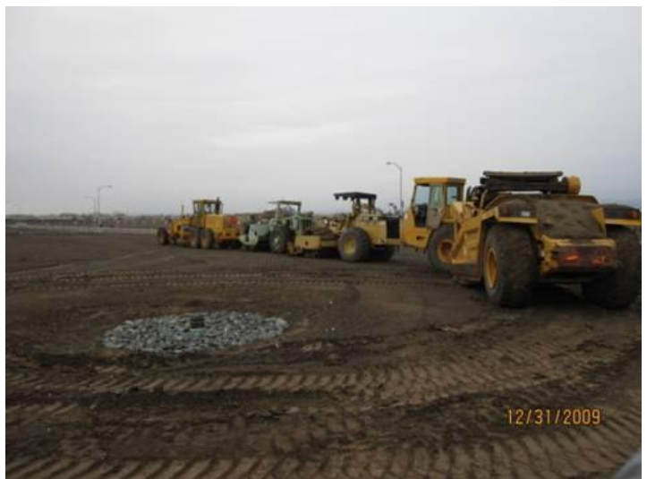
J-42 - Colusa County Education Outreach Facility