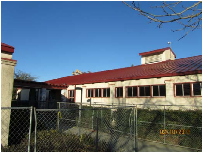
Building 400 Re-Roof Complete Woodland Community College