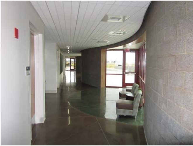
Interior Complete, Woodland CC Colusa County Outreach Facility