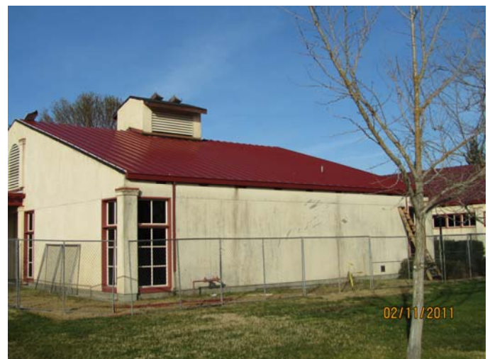
Building 300 Re-Roof Nearing Completion Woodland Community College