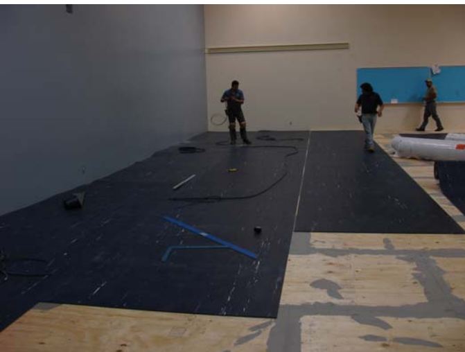
Building 1200 Renovation—Weight Room PE Complex, Volume II, Yuba College