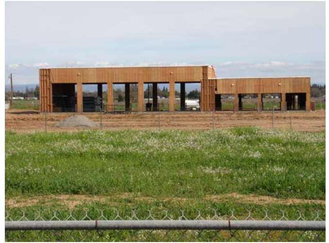
Vehicle Service Building, Yuba College Health & Public Safety Building