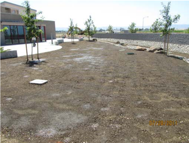
Landscaping Nearly Complete, Woodland CC Colusa County Outreach Facility