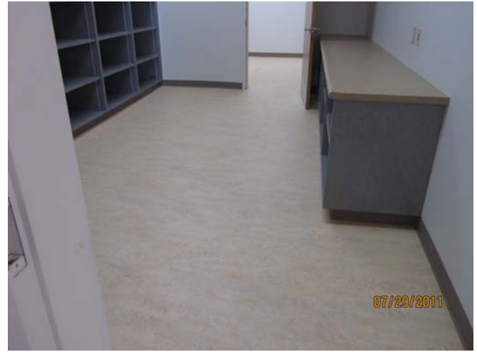
Multi-Building Renovations in Progress Woodland Community College