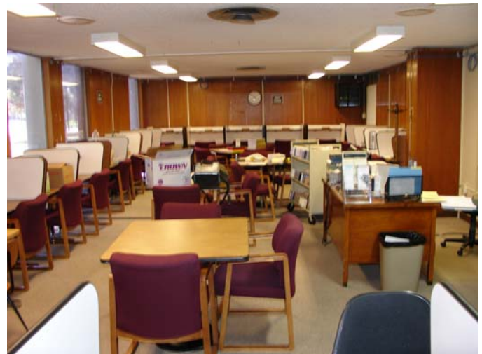
Temporary Quiet Study Building 1100, Library/LRC Renovation, Yuba College