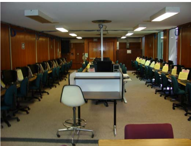
Temporary Computer Cyber Lab Building 1100, Library/LRC Renovation, Yuba College