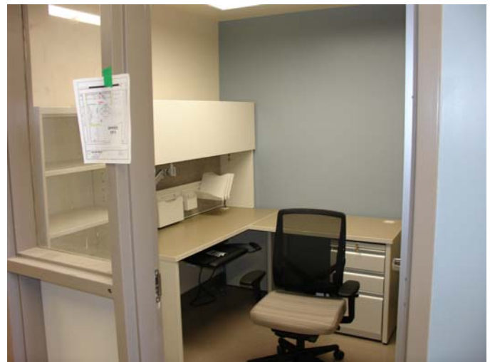
Renovated Coach Office Building 1200, PE Complex Vol II., Yuba College