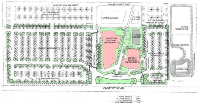
Project Site Plan