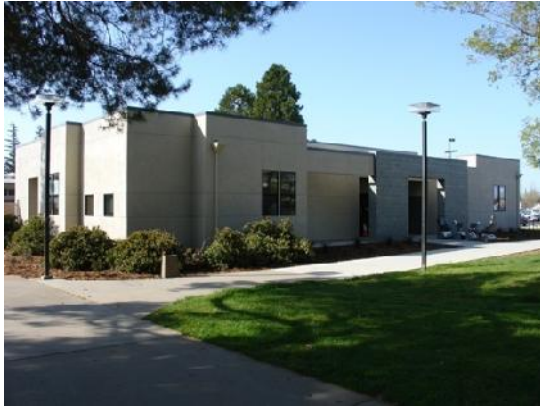
J-21 Building 1800 ADA Renovation Yuba College