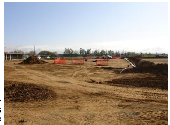
J-14 Athletics Fields Yuba College