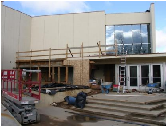
J-06 Building 400 Theatre Renovation Yuba College