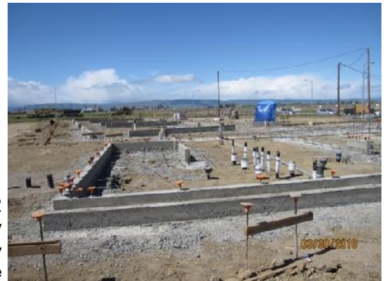
J-42 Colusa County Outreach Facility Woodland Community College