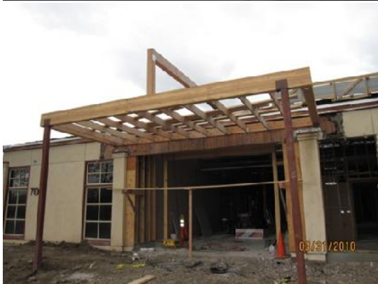
J-35 Building 700 Renovation Woodland Community College