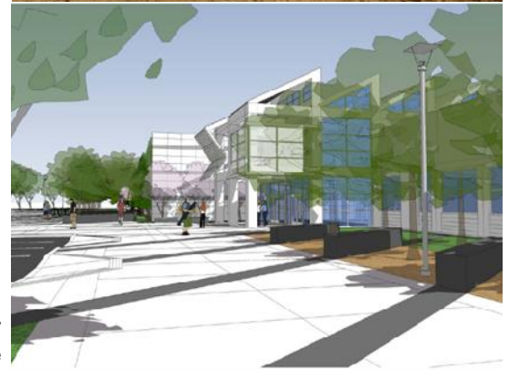
J-25 Health & Public Safety Yuba College