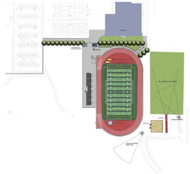
PE Complex—Athletic Fields, Site Plan Yuba College