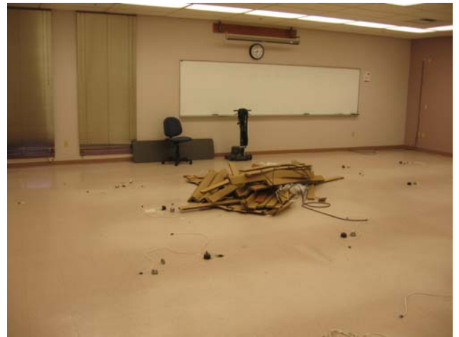
Geology Lab Renovation, Start of Demolition Woodland Community College