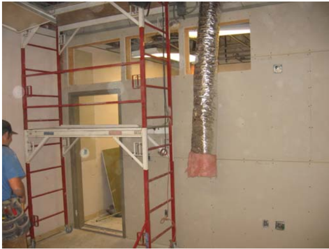
Campus Police Relocation, Construction in Progress Woodland Community College