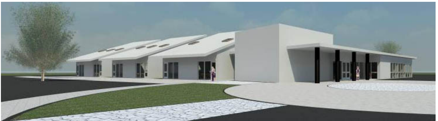
Colusa County Educational Outreach Facility Concept Design Woodland Community College