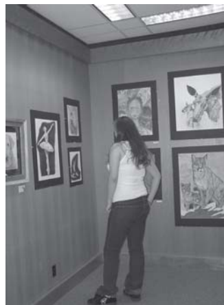
Library Art show

Community Education is a program of noncredit fee-based classes and activities designed to serve individuals with educational goals that do not require college credit. Its goal is to fulfill a role which enables the community to improve the quality of their lives through continuing education. There are no transcripts, grades, or academic requirements. Many classes are offered in response to an expressed interest or need by a specific population or organization. Obtain a Community Education schedule of course offerings by telephoning the Community Education Office at 530-741-6825.